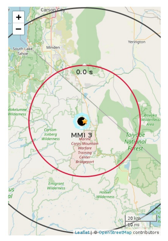
Figure 1. ShakeAlert initial earthquake location (black dot). Star is ANSS earthquake epicenter. Polygon approximates the outer range for felt ground motion. If shown, red circle is front of peak shaking when the message was released***. Shaking takes 10 s to expand from circle to circle.

This information is provisional and subject to revision. It is being provided to meet the need for timely best science. The information has not received final approval by the U.S. Geological Survey (USGS) and is provided on the condition that neither the USGS nor the U.S. Government shall be held liable for any damages resulting from the authorized or unauthorized use of the information.