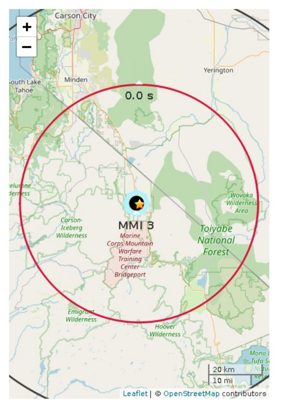
Figure 1. ShakeAlert initial earthquake location (black dot). Star is ANSS earthquake epicenter. Polygon approximates the outer range for felt ground motion. If shown, red circle is front of peak shaking when the message was released ***. Shaking takes 10 s to expand from circle to circle.