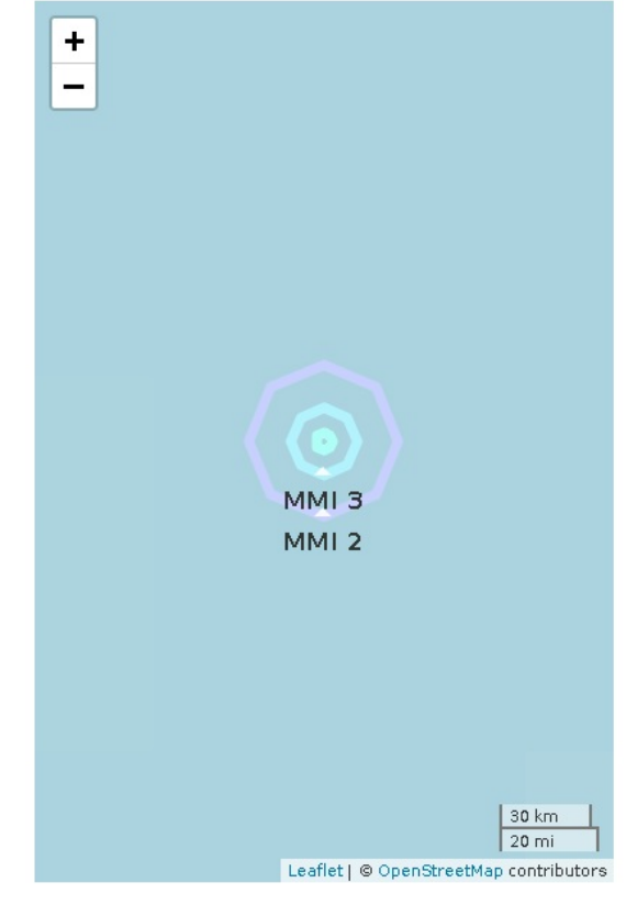
Figure 2. Polygons show shaking intensity contours for the peak magnitude ShakeAlert. Shaking of intensity 3 or less is often not felt. Regional network epicenter not available.