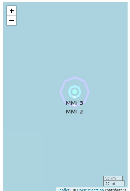
Figure 2. Polygons show shaking intensity contours for the peak magnitude ShakeAlert. Shaking of intensity 3 or less is often not felt. Regional network epicenter not available.

Report created 2021-07-21 05:31:10 (Pacific)