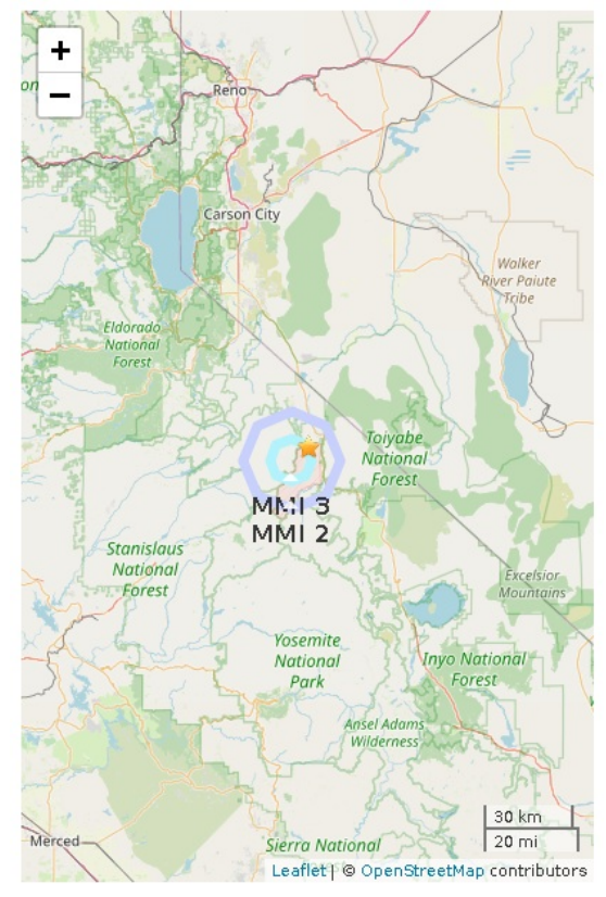
Figure 2. Polygons show shaking intensity contours for the peak magnitude ShakeAlert. Shaking of intensity 3 or less is often not felt. Star shows the regional network epicenter.