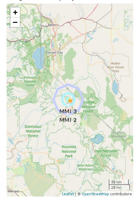
Figure 2. Polygons show shaking intensity contours for the peak magnitude ShakeAlert. Shaking of intensity 3 or less is often not felt. Star shows the regional network epicenter.