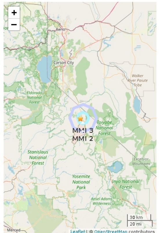
Figure 2. Polygons show shaking intensity contours for the peak magnitude ShakeAlert. Shaking of intensity 3 or less is often not felt. Star shows the regional network epicenter.