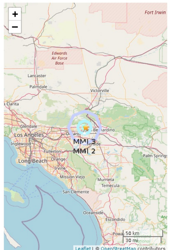
Figure 2. Polygons show shaking intensity contours for the peak magnitude ShakeAlert. Shaking of intensity 3 or less is often not felt. Star shows the regional network epicenter.