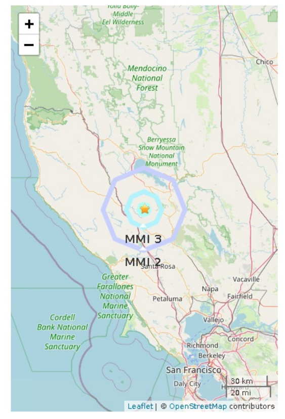
Figure 2. Polygons show shaking intensity contours for the peak magnitude ShakeAlert. Shaking of intensity 3 or less is often not felt. Star shows the regional network epicenter.