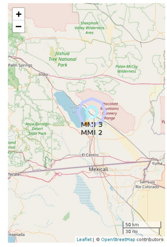
Figure 2. Polygons show shaking intensity contours for the peak magnitude ShakeAlert. Shaking of intensity 3 or less is often not felt. Star shows the regional network epicenter.