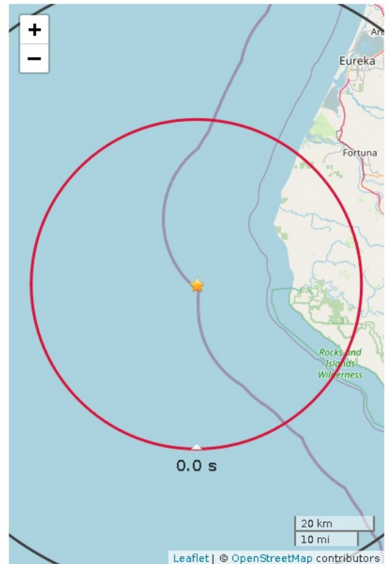
Figure 1. ShakeAlert initial earthquake location (black dot). Star is regional network epicenter. Polygon is the approximate outer range for felt ground motion. If shown***, red circle is front of peak shaking when the alert was released. Shaking takes 10 s to expand from circle to circle.

To learn more about ShakeAlert®, visit www.shakealert.org/FAQ