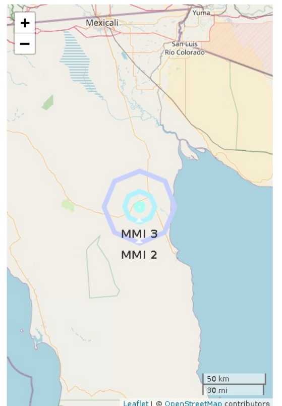
Figure 2. Polygons show shaking intensity contours for the peak magnitude ShakeAlert. Shaking of intensity 3 or less is often not felt. Regional network epicenter not available.

Report created 2021-02-23 04:26:58 (Pacific)