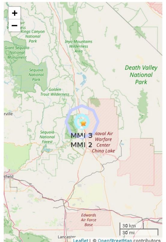
Figure 2. Polygons show shaking intensity contours for the peak magnitude ShakeAlert. Shaking of intensity 3 or less is often not felt. Star shows the regional network epicenter.