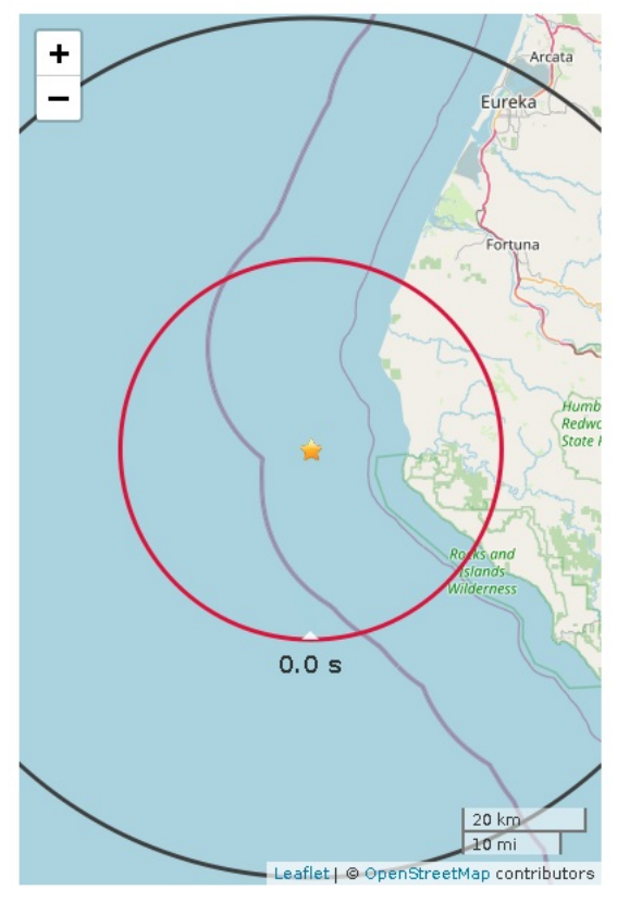
Figure 1. ShakeAlert initial earthquake location (black dot). Star is regional network epicenter. Polygon is the approximate outer range for felt ground motion. If shown***, red circle is front of peak shaking when the alert was released. Shaking takes 10 s to expand from circle to circle.