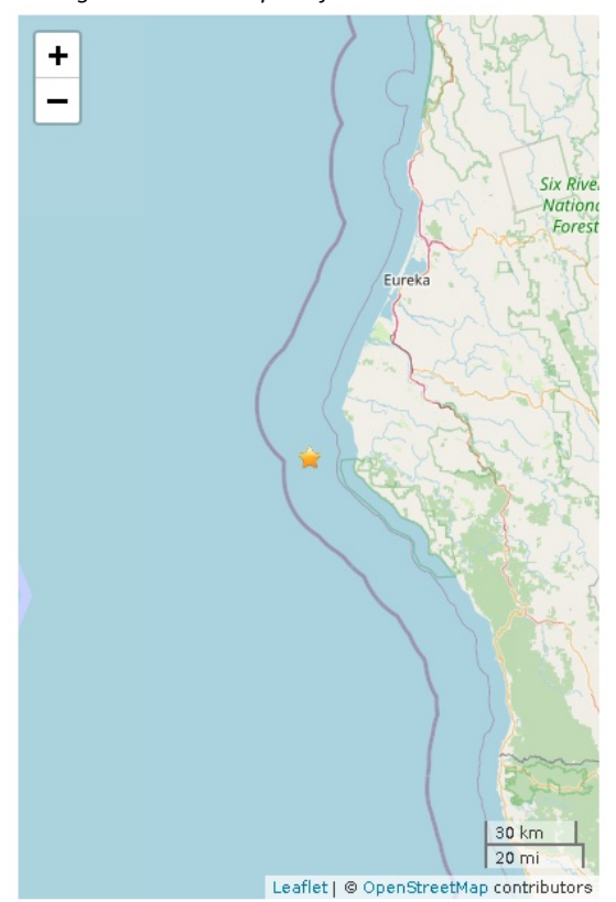
Figure 2. Polygons show shaking intensity contours for the peak magnitude ShakeAlert. Shaking of intensity 3 or less is often not felt. Star shows the regional network epicenter.

Figure 1. ShakeAlert initial earthquake location (black dot). Star is regional network epicenter. Polygon is the approximate outer range for felt ground motion. If shown***, red circle is front of peak shaking when the alert was released. Shaking takes 10 s to expand from circle to circle.