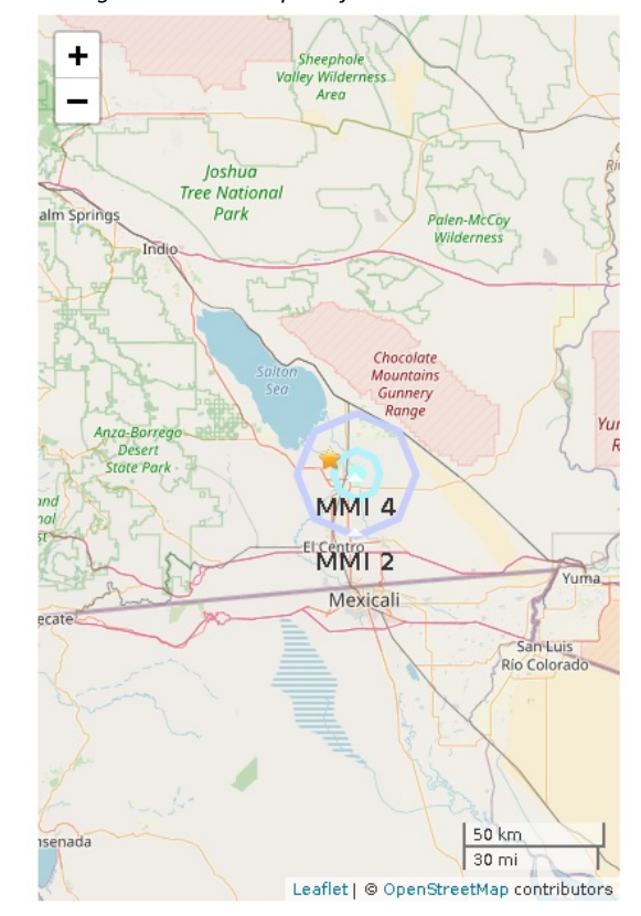
Figure 2. Polygons show shaking intensity contours for the peak magnitude ShakeAlert. Shaking of intensity 3 or less is often not felt. Star shows the regional network epicenter.

Figure 1. ShakeAlert initial earthquake location (black dot). Star is regional network epicenter. Polygon is the predicted outer range for felt ground motion (MMI 2). Red circle is front of peak shaking when the alert was released. Shaking takes 10 s to expand from circle to circle.