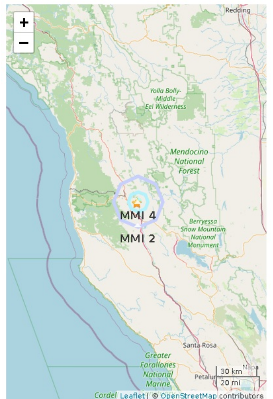
Figure 2. Polygons show shaking intensity contours for the peak magnitude ShakeAlert. Shaking of intensity 3 or less is often not felt. Star shows the regional network epicenter.

Report created 2020-08-18 18:48:53 (Pacific)