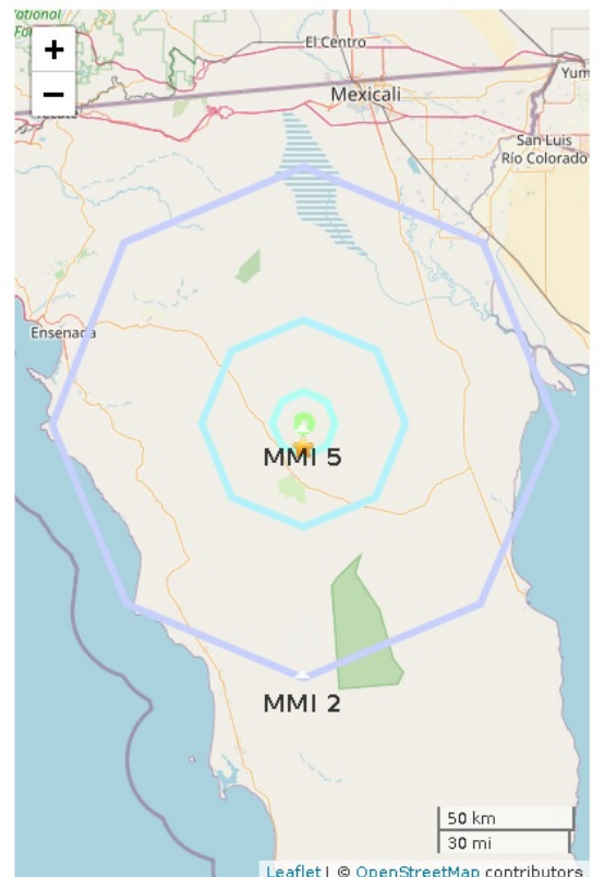
Figure 2. Polygons show shaking intensity contours for the peak magnitude ShakeAlert. Shaking of intensity 3 or less is often not felt. Star shows the regional network epicenter.

Report created 2020-08-17 08:15:12 (Pacific)