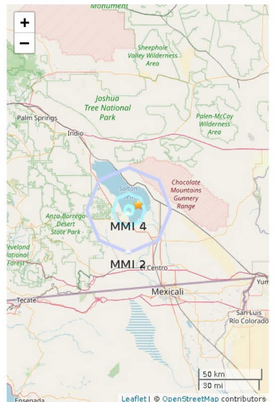
Figure 2. Polygons show shaking intensity contours for the peak magnitude ShakeAlert. Shaking of intensity 3 or less is often not felt. Star shows the regional network epicenter.