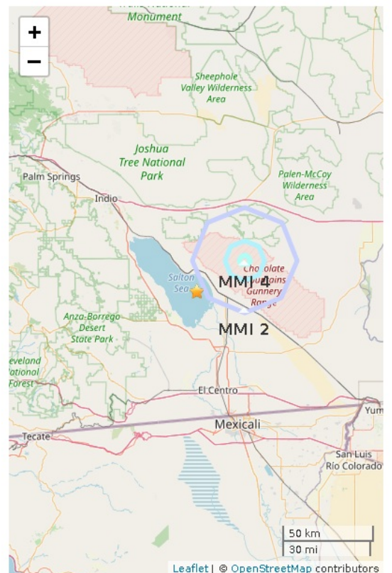
Figure 2. Polygons show shaking intensity contours for the peak magnitude ShakeAlert. Shaking of intensity 3 or less is often not felt. Star shows the regional network epicenter.