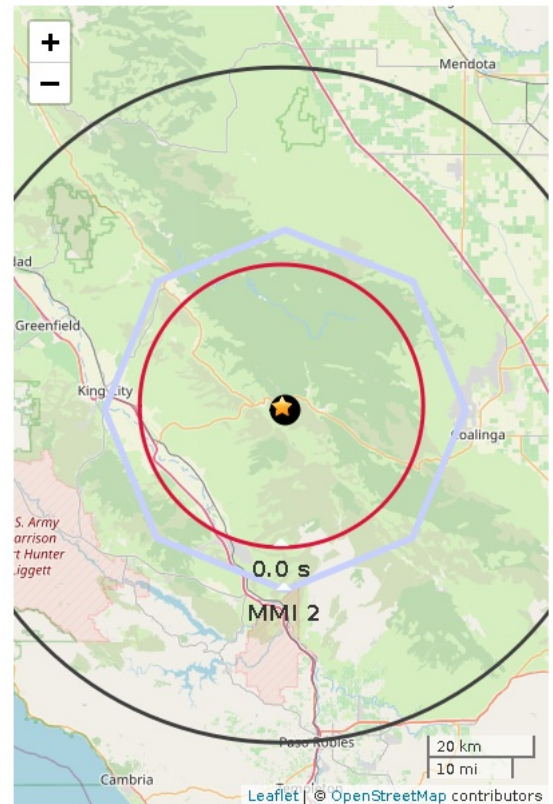
Figure 1. ShakeAlert initial earthquake location (black dot). Star is regional network epicenter. Polygon is the predicted outer range for felt ground motion (MMI 2). Red circle is front of peak shaking when the alert was released. Shaking takes 10 s to expand from circle to circle.

To learn more about ShakeAlert®, visit www.shakealert.org/FAQ