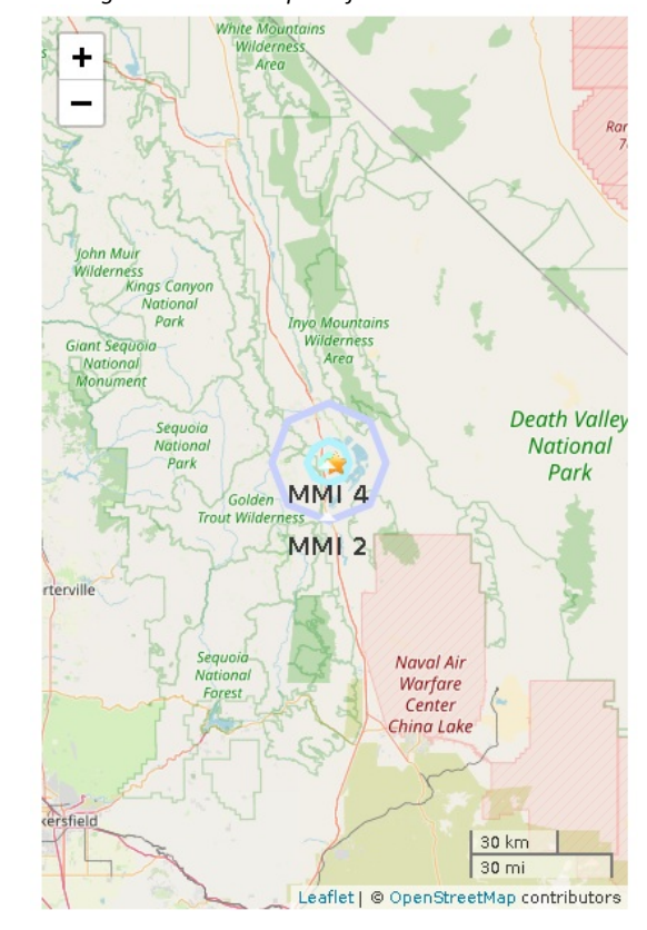
Figure 2. Polygons show shaking intensity contours for the peak magnitude ShakeAlert. Shaking of intensity 3 or less is often not felt. Star shows the regional network epicenter.