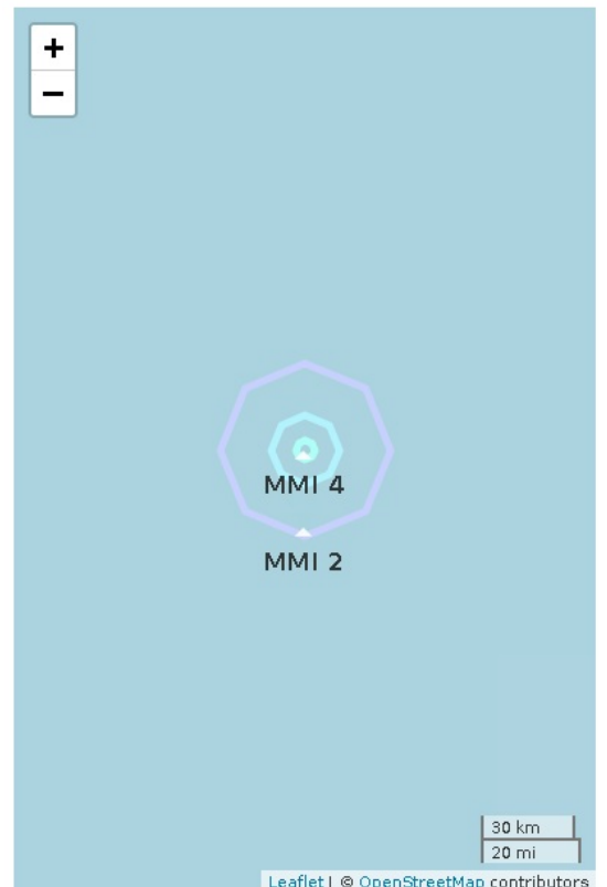
Figure 2. Polygons show shaking intensity contours for the peak magnitude ShakeAlert. Shaking of intensity 3 or less is often not felt. Regional network epicenter not available.

Report created 2020-06-25 08:13:01 (Pacific)