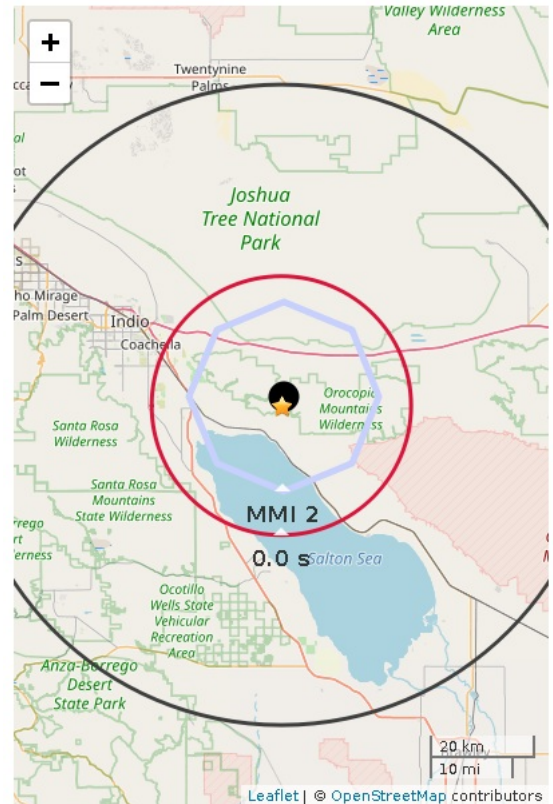
Figure 1. ShakeAlert initial earthquake location (black dot). Star is regional network epicenter. Polygon is the predicted outer range for felt ground motion (MMI 2). Red circle is front of peak shaking when the alert was released. Shaking takes 10 s to expand from circle to circle.

To learn more about ShakeAlert®, visit www.shakealert.org/FAQ