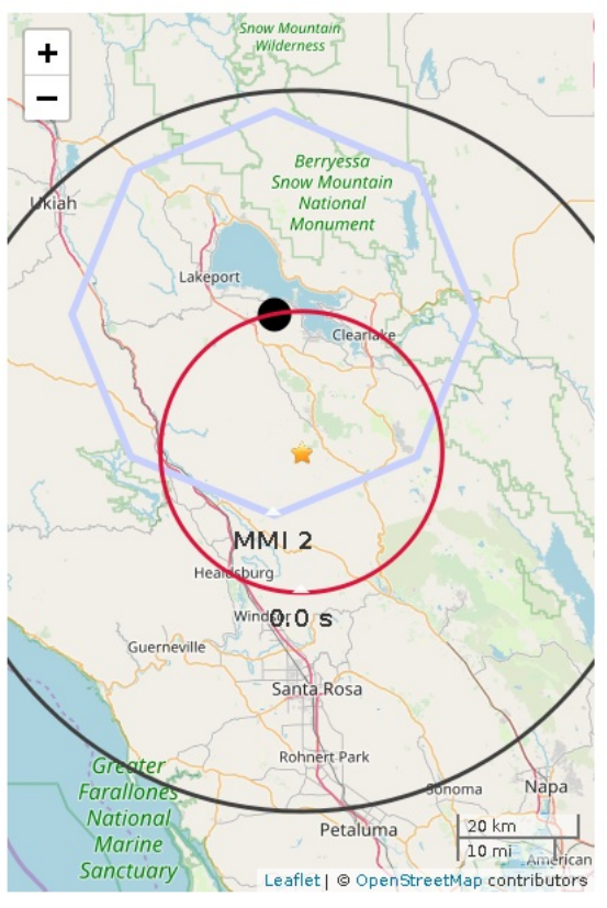
Figure 1. ShakeAlert initial earthquake location (black dot). Star is regional network epicenter. Polygon is the predicted outer range for felt ground motion (MMI 2). Red circle is front of peak shaking when the alert was released. Shaking takes 10 s to expand from circle to circle.