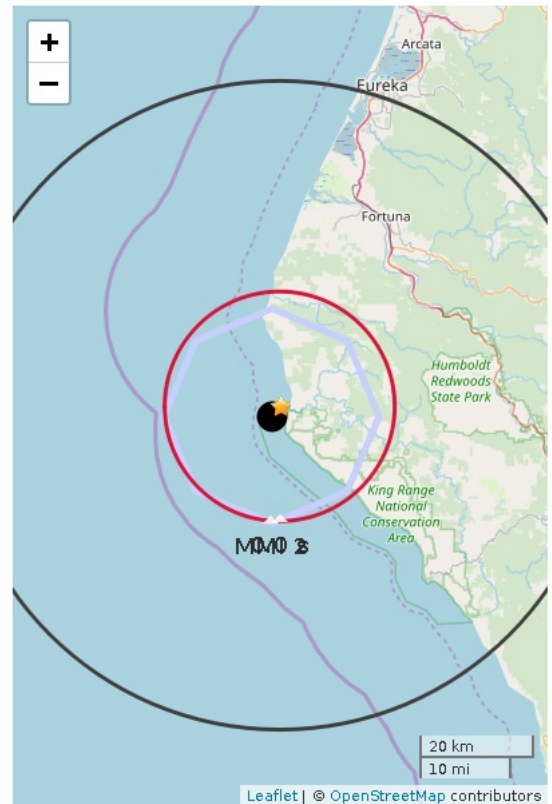
Figure 1. ShakeAlert initial earthquake location (black dot). Star is regional network epicenter. Polygon is the predicted outer range for felt ground motion (MMI 2). Red circle is front of peak shaking when the alert was released. Shaking takes 10 s to expand from circle to circle.

To learn more about ShakeAlert®, visit www.shakealert.org/FAQ