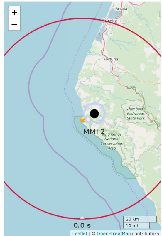
Figure 1. ShakeAlert initial earthquake location (black dot). Star is regional network epicenter. Polygon is the predicted outer range for felt ground motion (MMI 2). Red circle is front of peak shaking when the alert was released. Shaking takes 10 s to expand from circle to circle.

To learn more about ShakeAlert®, visit www.shakealert.org/FAQ