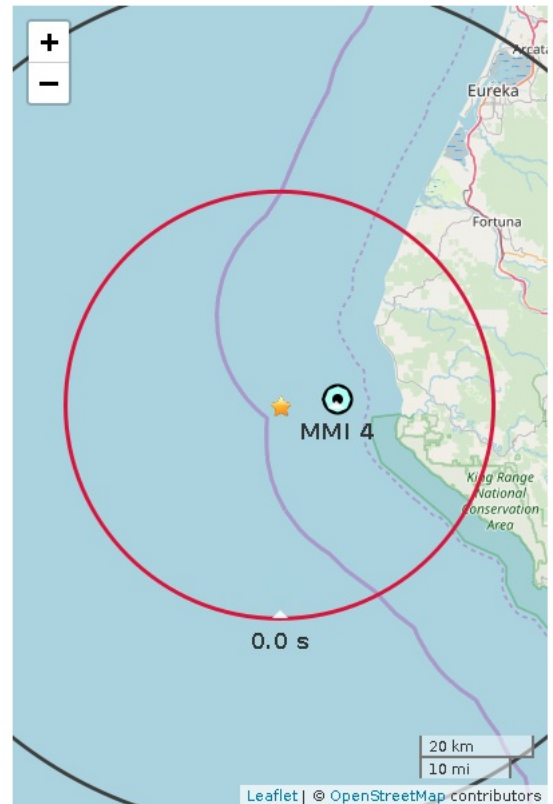
Figure 1. ShakeAlert initial earthquake location (black dot). Star is regional network epicenter. Polygon is the predicted outer range for felt ground motion (MMI 2). Red circle is front of peak shaking when the alert was released. Shaking takes 10 s to expand from circle to circle.

To learn more about ShakeAlert®, visit www.shakealert.org/FAQ