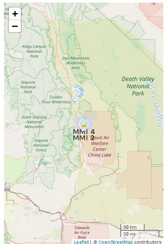
Figure 2. Polygons show shaking intensity contours for the final ShakeAlert. Shaking of intensity 3 or less is often not felt. Star shows the regional network epicenter.

Report created 2019-10-22 19:19:26 (Pacific)