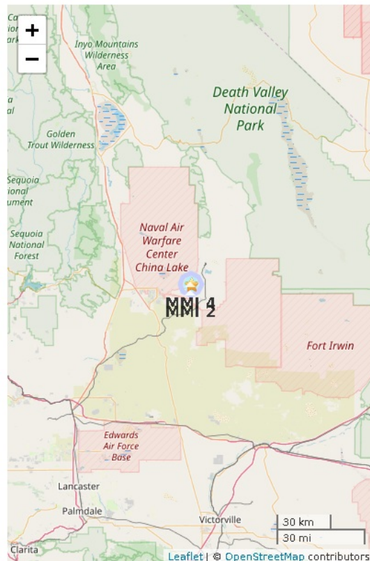
Figure 2. Polygons show shaking intensity contours for the final ShakeAlert. Shaking of intensity 3 or less is often not felt. Star shows the regional network epicenter.