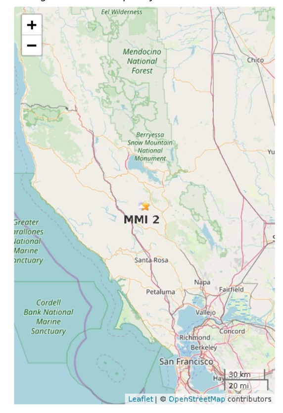
Figure 2. Polygons show shaking intensity contours for the final ShakeAlert. Shaking of intensity 3 or less is often not felt. Star shows the regional network epicenter.