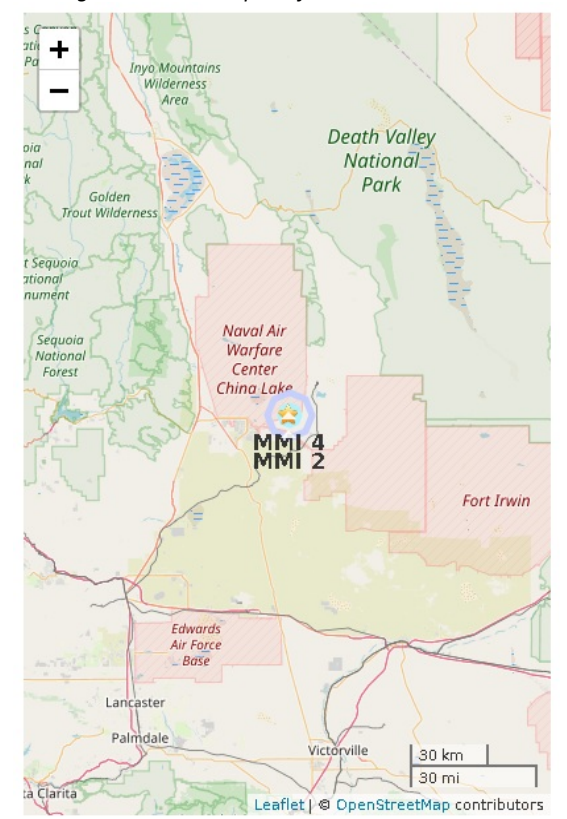
Figure 2. Polygons show shaking intensity contours for the final ShakeAlert. Shaking of intensity 3 or less is often not felt. Star shows the regional network epicenter.

Figure 1. ShakeAlert earthquake location (black dot). Star is regional network epicenter. Polygon is the predicted outer range for felt ground motion (MMI 2). Red circle is front of peak shaking when the alert was released. Shaking takes 10 s to expand from circle to circle.