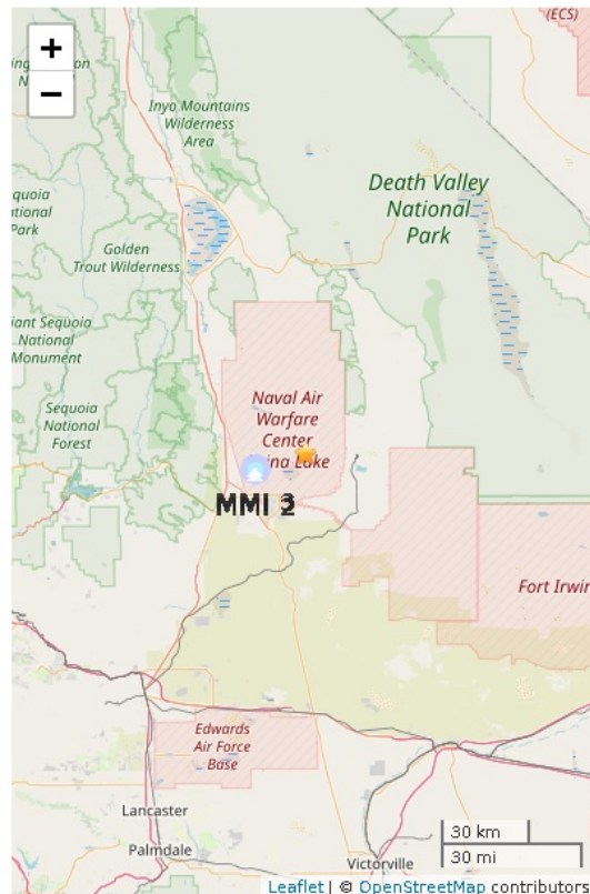
Figure 2. Polygons show shaking intensity contours for the final ShakeAlert. Shaking of intensity 3 or less is often not felt. Star shows the regional network epicenter.