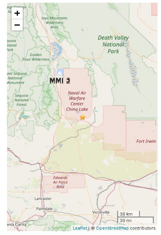
Figure 2. Polygons show shaking intensity contours for the final ShakeAlert. Shaking of intensity 3 or less is often not felt. Star shows the regional network epicenter.