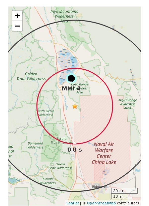
Figure 1. ShakeAlert earthquake location (black dot). Star is regional network epicenter. Polygon is the predicted outer range for felt ground motion (MMI 2). Red circle is front of peak shaking when the alert was released. Shaking takes 10 s to expand from circle to circle.