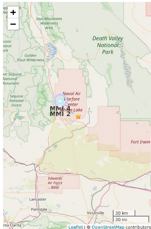
Figure 2. Polygons show shaking intensity contours for the final ShakeAlert. Shaking of intensity 3 or less is often not felt. Star shows the regional network epicenter.