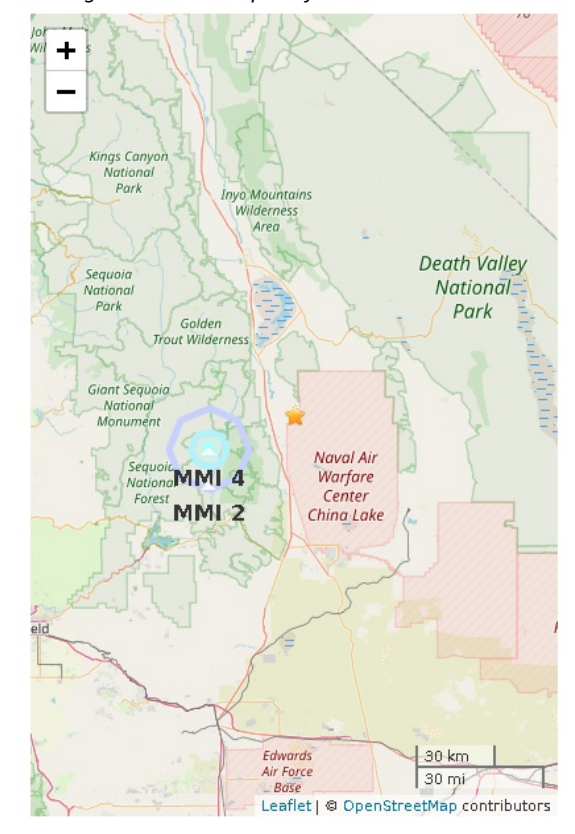
Figure 2. Polygons show shaking intensity contours for the final ShakeAlert. Shaking of intensity 3 or less is often not felt. Star shows the regional network epicenter.