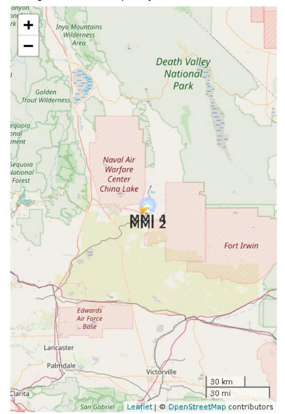
Figure 2. Polygons show shaking intensity contours for the final ShakeAlert. Shaking of intensity 3 or less is often not felt. Star shows the regional network epicenter.

Figure 1. ShakeAlert earthquake location (black dot). Star is regional network epicenter. Polygon is the predicted outer range for felt ground motion (MMI 2). Red circle is front of peak shaking when the alert was released. Shaking takes 10 s to expand from circle to circle.