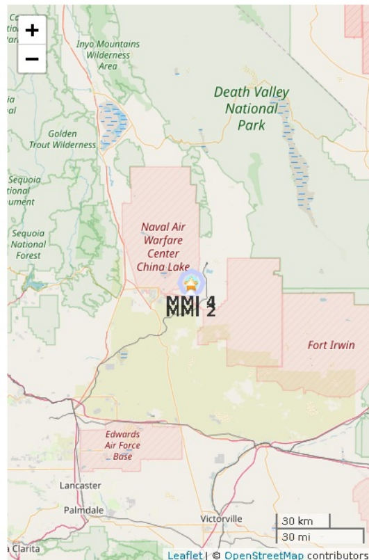
Figure 2. Polygons show shaking intensity contours for the final ShakeAlert. Shaking of intensity 3 or less is often not felt. Star shows the regional network epicenter.

Report created 2019-07-06 01:01:16 (Pacific)