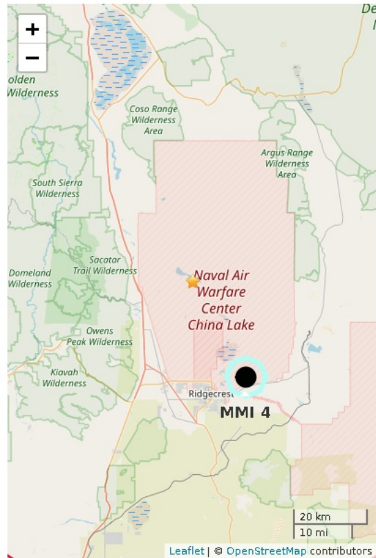
Figure 1. ShakeAlert earthquake location (black dot). Star is regional network epicenter. Polygon is the predicted outer range for felt ground motion (MMI 2). Red circle is front of peak shaking when the alert was released. Shaking takes 10 s to expand from circle to circle.

To learn more about ShakeAlert, visit www.shakealert.org/FAQ