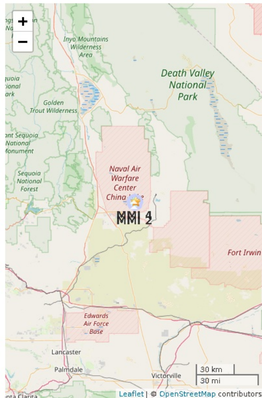
Figure 2. Polygons show shaking intensity contours for the final ShakeAlert. Shaking of intensity 3 or less is often not felt. Star shows the regional network epicenter.

Report created 2019-07-04 21:16:49 (Pacific)