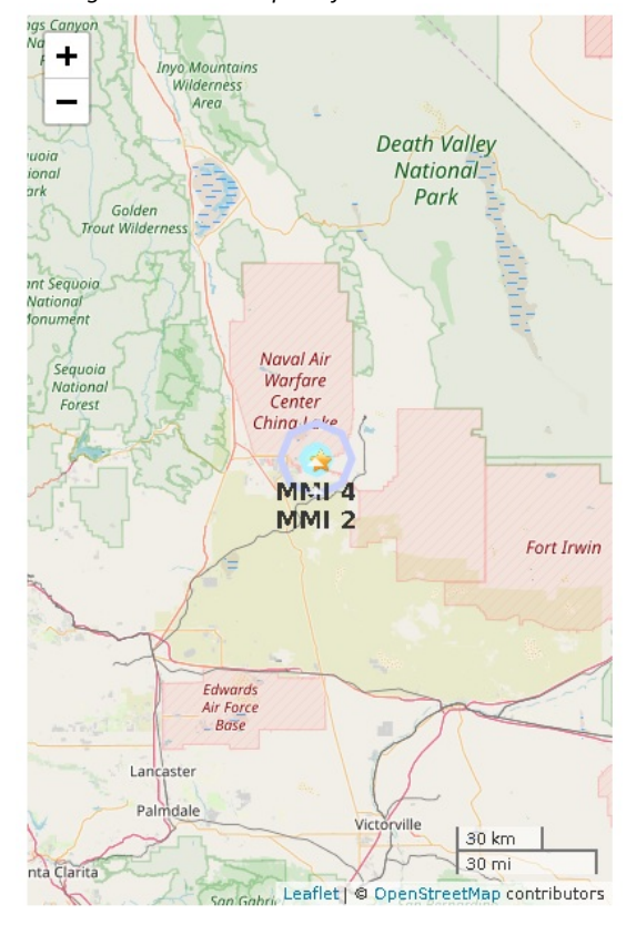
Figure 2. Polygons show shaking intensity contours for the final ShakeAlert. Shaking of intensity 3 or less is often not felt. Star shows the regional network epicenter.