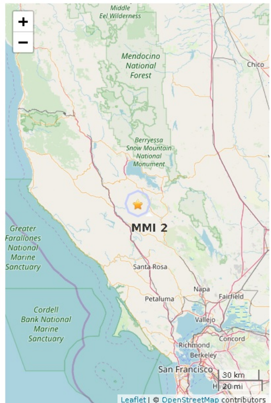
Figure 2. Polygons show shaking intensity contours for the final ShakeAlert. Shaking of intensity 3 or less often is not felt. Star shows the regional network epicenter.