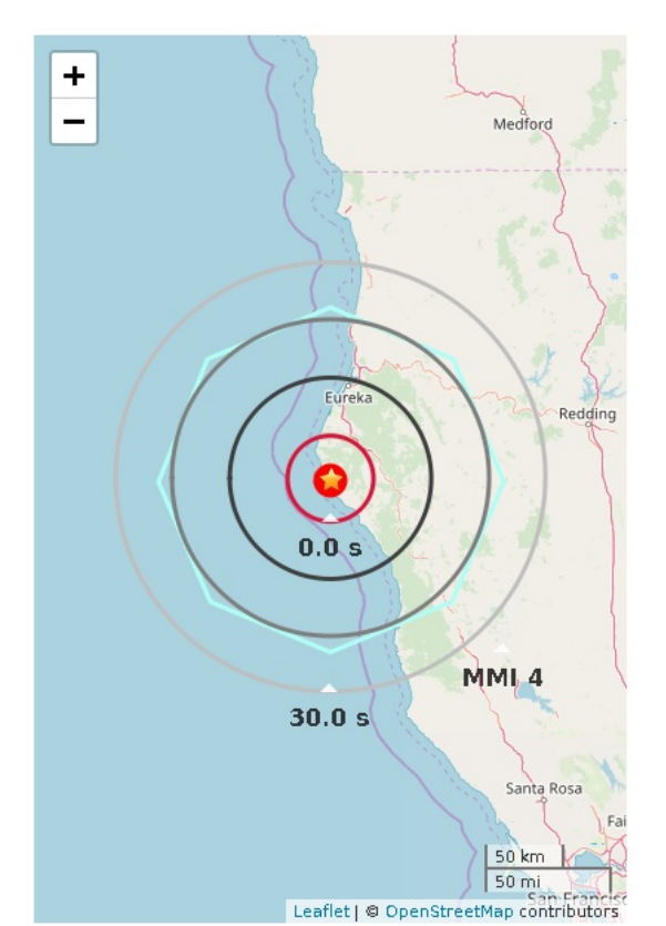
Figure 1. ShakeAlert earthquake location (red dot). Star is regional network epicenter. MMI 4 polygon is the estimated initial alert area. Red circle is locus of peak shaking when the alert was released. Shaking takes 10 s to expand from circle to circle.

This information is preliminary or provisional and is subject to revision. It is being provided to meet the need for timely best science. The information has not received final approval by the U.S. Geological Survey (USGS) and is provided on the condition that neither the USGS nor the U.S. Government shall be held liable for any damages resulting from the authorized or unauthorized use of the information. To learn more about ShakeAlert, visit www.shakealert.org/FAQ