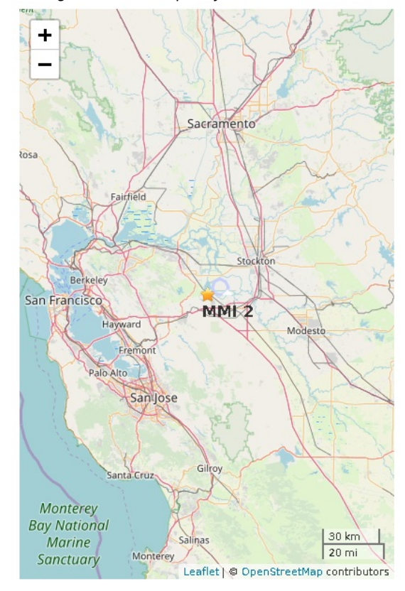
Figure 2. Polygons show shaking intensity contours for the final ShakeAlert. Shaking of intensity 3 or less often is not felt. Star shows the regional network epicenter.