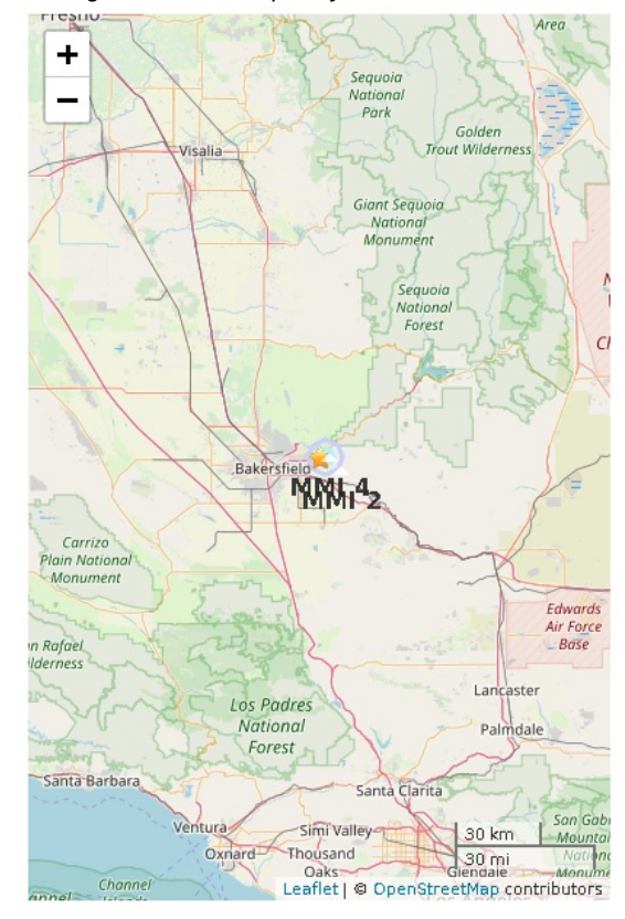
Figure 2. Polygons show shaking intensity contours for the final ShakeAlert. Shaking of intensity 3 or less often is not felt. Star shows the regional network epicenter.